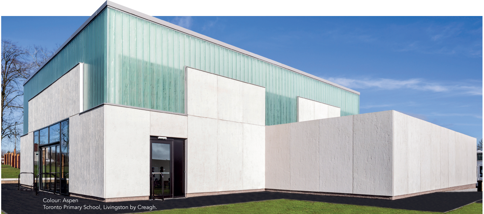
Colour: Aspen Toronto Primary School, Livingston by Creagh.